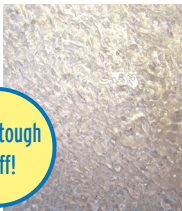
CrystalGel sprayed with Hopper Gun