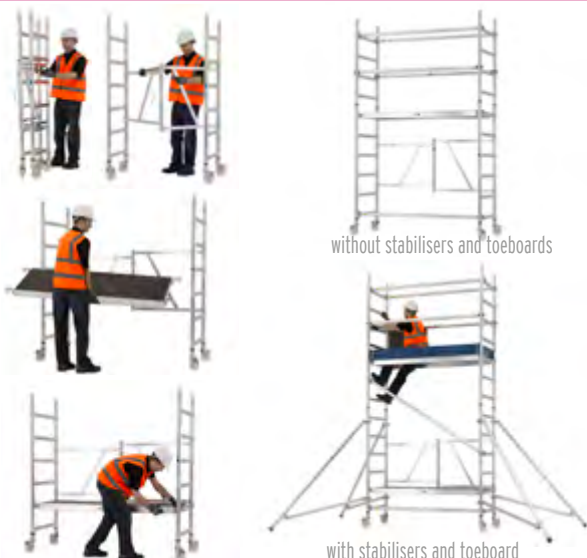
without stabilisers and toeboards