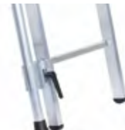
Universal Stile Extension