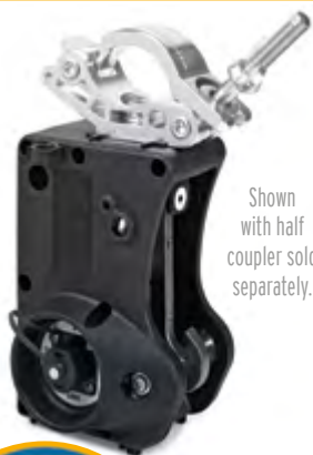
Shown with half coupler sold separately.

EK2 Electro Kabuki Units This award-winning design will reliably release weights of up to 50 kg. It can be used to drop items such as backdrops, dummies or cables on cue from a remote position. The load can be released as a vertical drop or at angles up to horizontal. The item is attached to a hook arm which pivots free when the magnet is energised. A clever spring is incorporated to throw the arm clear of the magnet