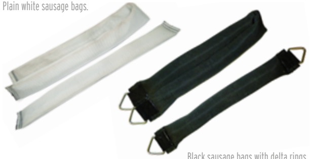
Black sausage bags with delta rings.